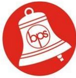
Bacton Primary School