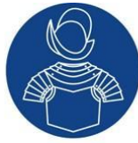
Mendlesham Primary School